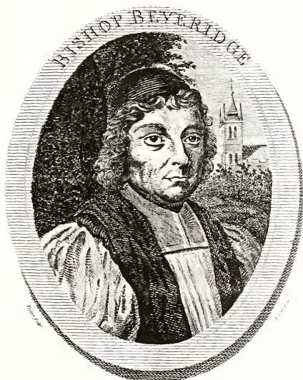
Portrait of the late Bishop of Exeter From an original drawing